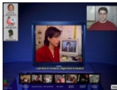
Figure 5. Video case studies.

The interviewees are given a very simple interface