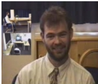
Figure 4. Multiple Camera Views.

The introduction of multiple camera views (Figure 4) significantly improves the sense of shared space between participants. This enables interviewers to make better observations of a candidate. Such observations can give