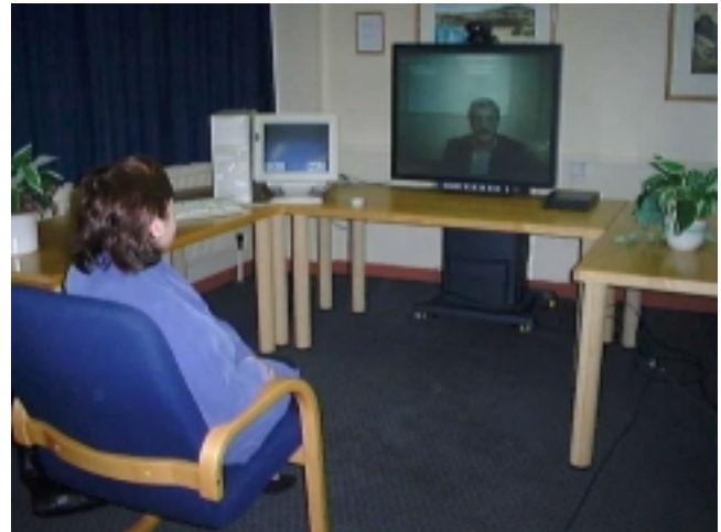
Figure 2. Interviewing with the Deluxe Configuration.

interviewer room and vice versa by moving around the furniture. An organization therefore needs to allocate just one room and purchase one set of equipment for remote interviews.