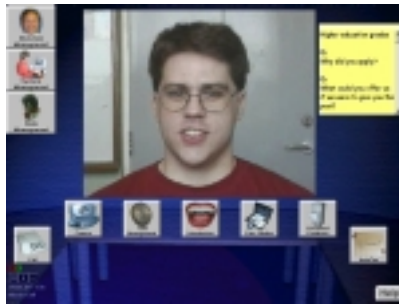
Figure 6. Top-level desktop interface for interviewers.

On entering the system management or data management sub-interfaces, the background will change hue to signify the separate section. The style of the interface will also change. System managers are presented with a tool-based functional interface, much like the windows “system” control in the control panel. Data managers are presented with a web-like interface.